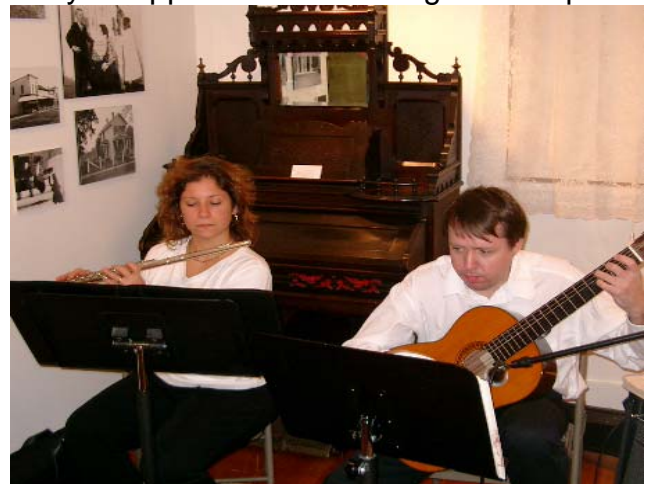
Musicians from the Laurel School of Music Play at the Reception