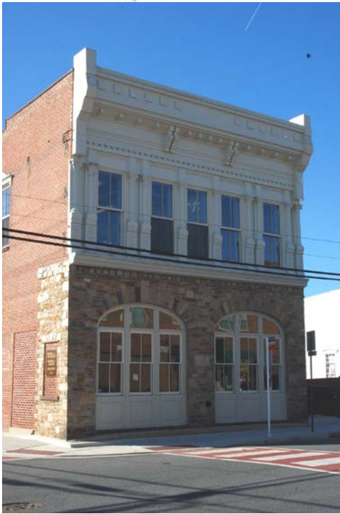
The Harrison-Beard on Montgomery Street

Please join us for an exclusive look inside some of Laurel's homes and buildings. See lovely decorations, a variety of architecture, an array of renovations, and learn a little history, too.