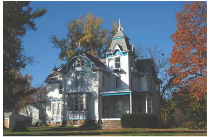
"The Phelps House" on Montgomery Street, Photo by Frieda Weise

These are private residences, so no strollers or high heels inside, please.