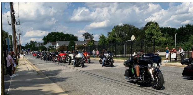
Figure 1 Motorcyclists at the 2022 Emancipation Day Parade.